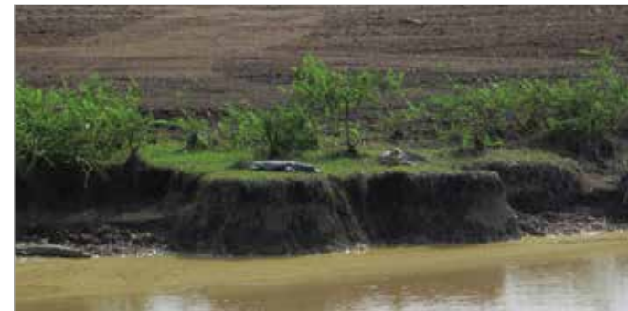
Fig. 2 - Agroindustrial monocrop in Orocué, Casanare