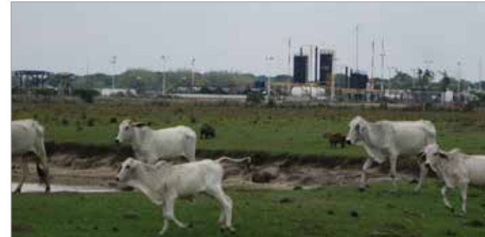
Fig. 1 - Oil extraction site in Yopal, Casanare

Key words: rural and regional planning, spatial planning, political ecology, extractivism , rural development, new rurality , urban/rural continuum.